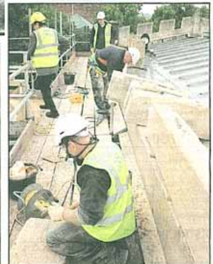
NOW AND THEN... Workers today on the roof of Holy Trinity and (left) the photograph showing the workers believed to have planted the time capsule.